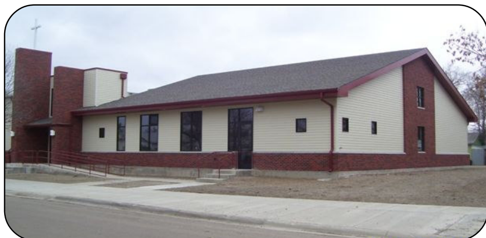
Immaculate Conception Church