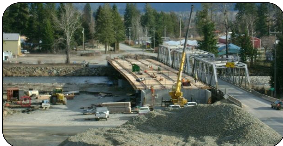
The old and the new Lightning Creek Bridges